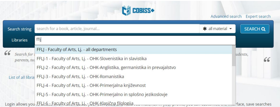
Sample search in the Faculty of Arts, Lj – all departments